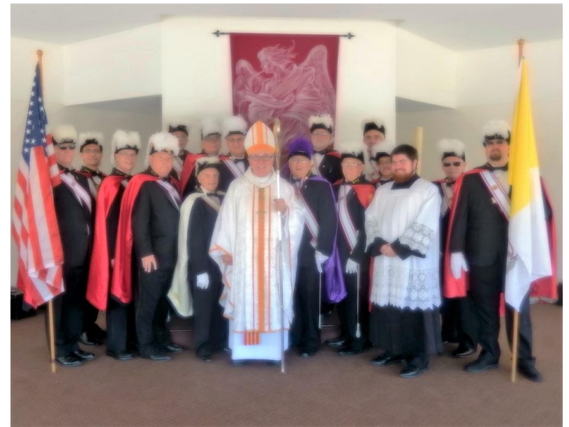
In this picture, although it is hard to see, there are 9 members of our Council posing with Bishop Kane